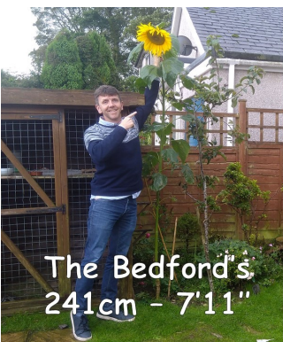
The Bedford's 241cm - 7'11"