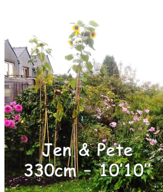
Jen & Pete 330cm - 10'10"