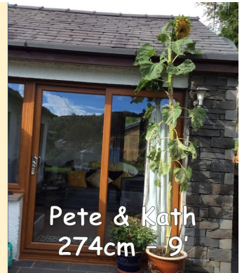
Pete & Kath 274cm - 9'