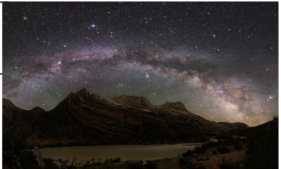
The Milky Way!

In the beginning God said.... 'Let There Be Light ' (Genesis 1:3)